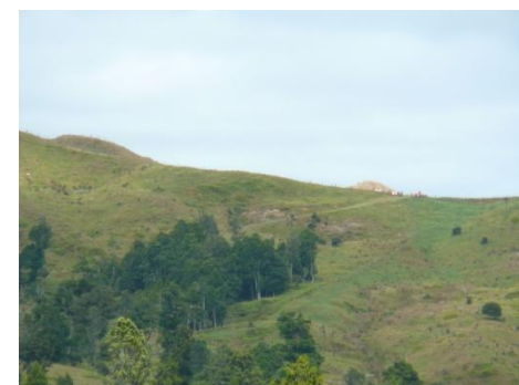
One of the ridges traversed in the distance