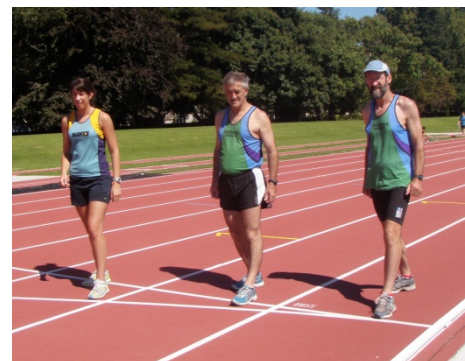
Walk start 24/1/09 Open Meet

administrator having managed the Porritt Classic athletic meeting for a number of years and served on the organising committees for various New Zealand championships held in the Waikato Bay of Plenty region. He has managed 11 New Zealand teams to international competitions, which include the world junior and youth championships and more recently the athletics section to the 2007 World University Games in Thailand.