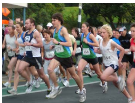
10km Mt Joggers start