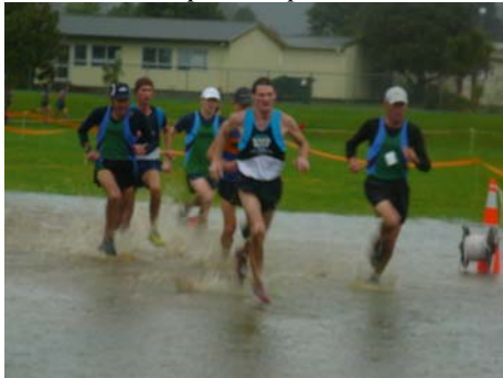
Masters bunch in an early lap