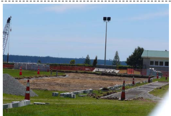
Yes: They’ve started it! : Digging at the Tauranga Domain commenced on schedule for laying the All-weather Track