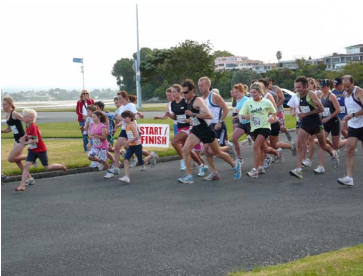
Start of the 29 th November Run