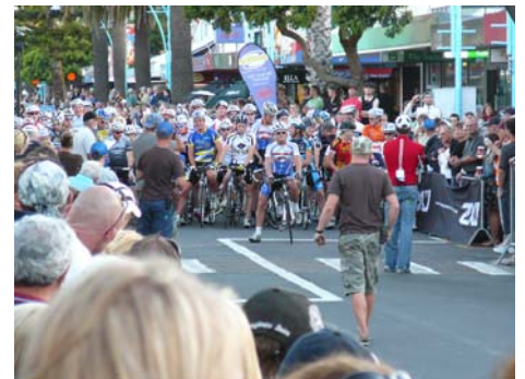
Start of the Elite Mens Cycle Race

Ramblers also put in a team to contest the $1000 prize for the top 5 placed club athletes in any grade: namely Open Men & Women or Vet Men 40+ or Women 40+, excluding the elite grade, who were contesting individual cash.