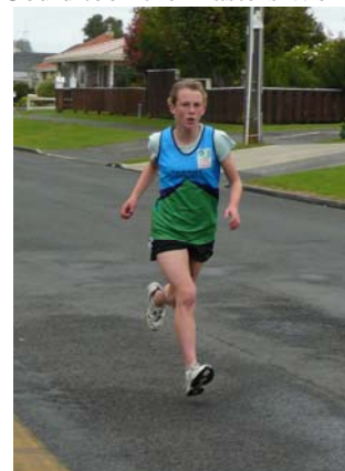
Mystique won the 2km