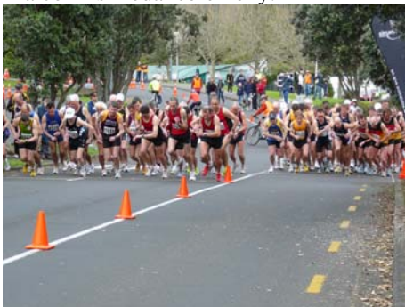
Start line for the Masters Mens race. Waikato were crammed against the kerb to the right.