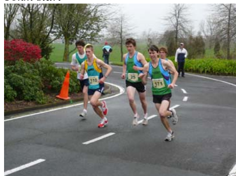
M19 8km start