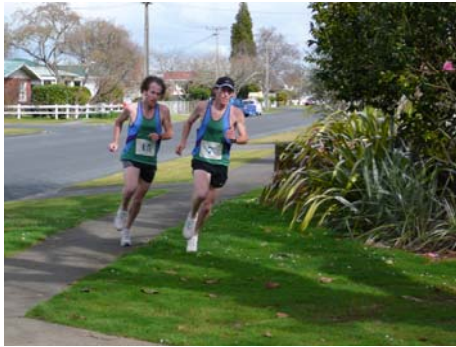
1 st lap the Maccas are as close as twins and in perfect sync.